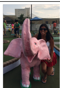
Elephants are my favorite kind of animal. What is your favorite animal?