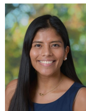
This is me!