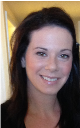
Me without a mask