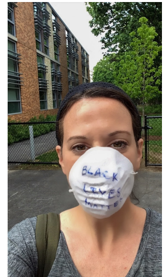
Me with a mask

I can't wait to meet you at the Ruffin Ridley School! See you soon!